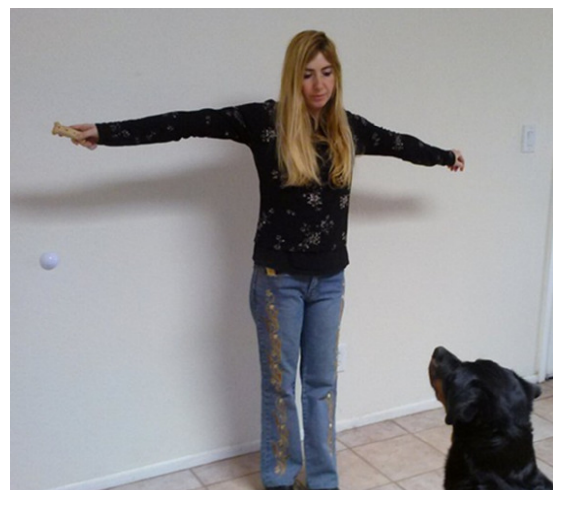
Here I am doing my best airplane impression! Notice the large cookie protruding from one hand.

Find a quiet area with few distractions. When you're ready to begin, hold a dog cookie in one of your hands, letting it protrude from your fingers so your dog sees it. Now, stretch your arms out as though you were an airplane, while keeping the cookie in clear view.