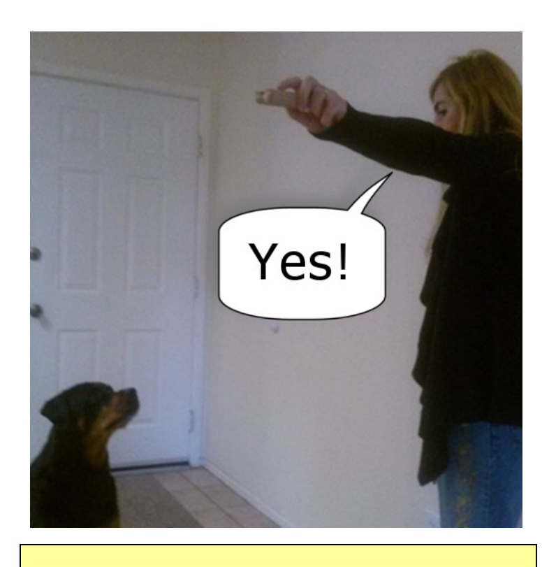
"yes" and immediately drop the treat!

If your dog is highly food motivated, he'll likely look at the cookie in your hand and perhaps even drool. If he's the type of dog who gets frustrated, he may bark or paw at you, and if he's a jumper he may attempt to jump up and grab it! Ignore these behaviors and keep the cookie firmly held so he can't get it.