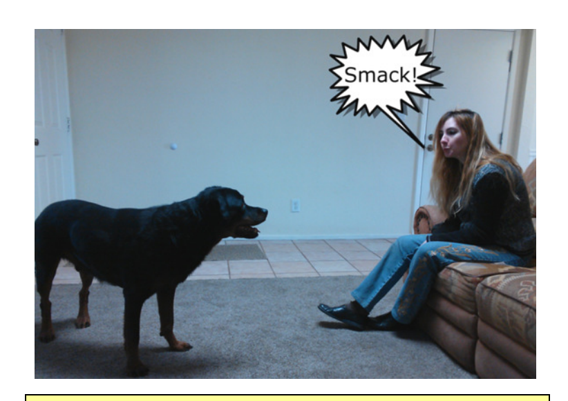
Once I have trained Einstein to respond to my smacking sound, I can use it whenever I want to get his attention.

To do this, with your dog in a quiet room, make a smacking sound as though you were kissing the air, then immediately give him a treat. It doesn't matter what he's doing